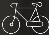
Walk to Cycle