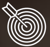
Life Skills through games