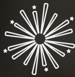
Diwali for all